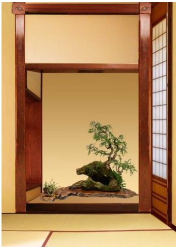
Acacia howittii 2021 Public Choice Award in "Tokonoma" or display space.

Canberra Bonsai Society and the Australian National Botanic Gardens are pleased to present the 2022 Exhibition of Australian Plants as Bonsai, which will be held in the Crosbie Morrison Building, ANBG on 26-27 February 2022 .