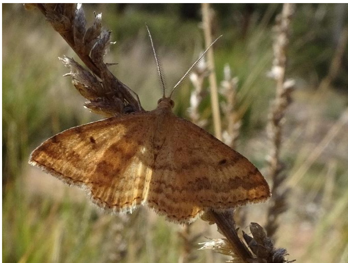
Scopula rubraria Reddish Wave moth. Sometimes referred to as a plantain Moth.