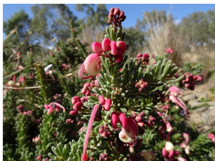
Grevillea lanigera Woolly Grevillea. Named for its noticeable woolly leaves and branchlets.