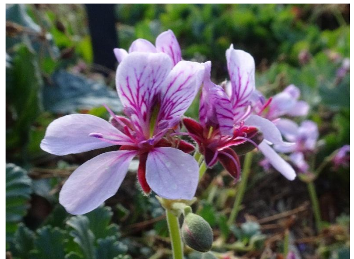
Pelargonium sp. Striatellum Omeo Storksbill. A yet to be formally named endangered species.