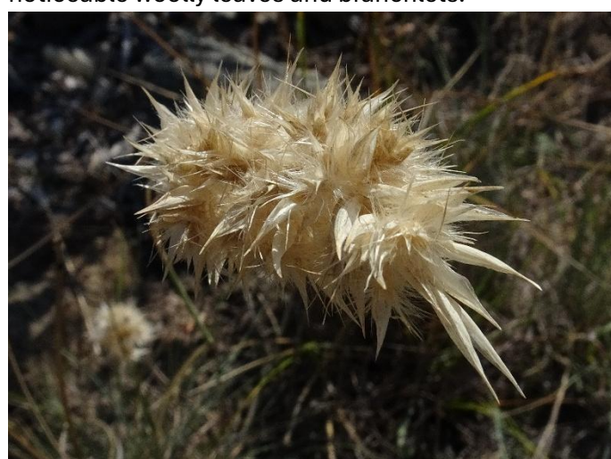
Rytidosperma bipartitum Leafy Wallaby-grass. The dense fluffy seedheads of the species are of note.

Our working bees are held every Thursday from 8-30am. Morning tea (byo) is at 10am at the tables near the shed. Tools are supplied. New volunteers are welcome, park near the Forest 20 entrance, just turn up and make yourself known.