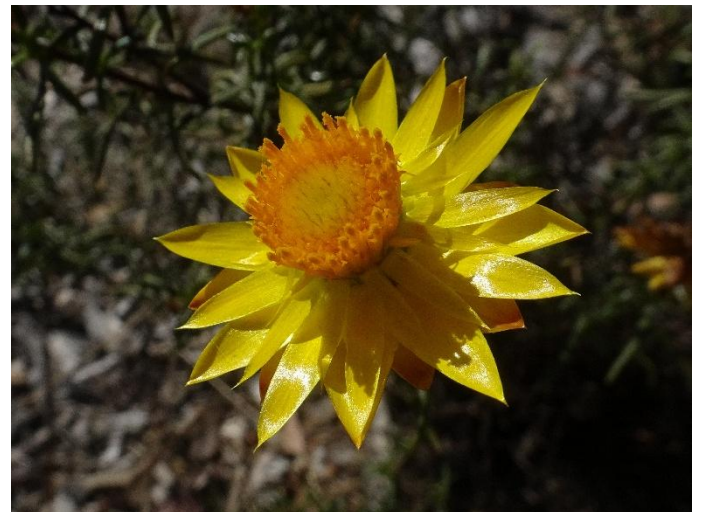
Xerochrysum viscosum Sticky Everlasting. A perennial local daisy that is seen on roadsides.