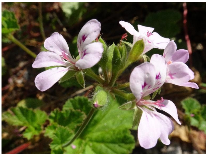
Pelargonium australe Austral Storksbill. A hardy perennial species attracts the Blue-banded Bee.