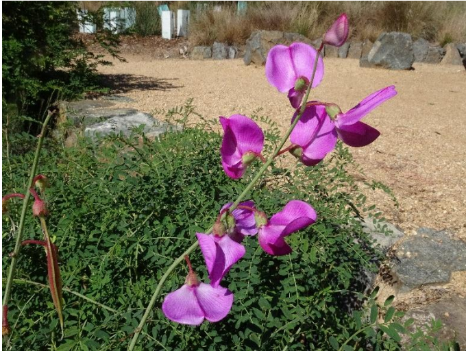
Swainsonia galegifolia Smooth Darling Pea. A particularly long flowering tall perennial pea.