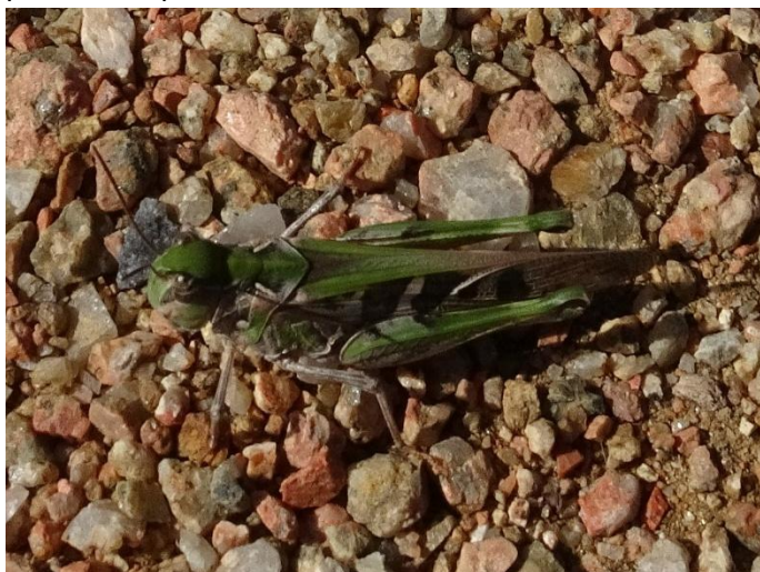
Oedaleus Australia Australian Oedaleus Grasshopper. Also called the Eastern Plague Grasshopper.