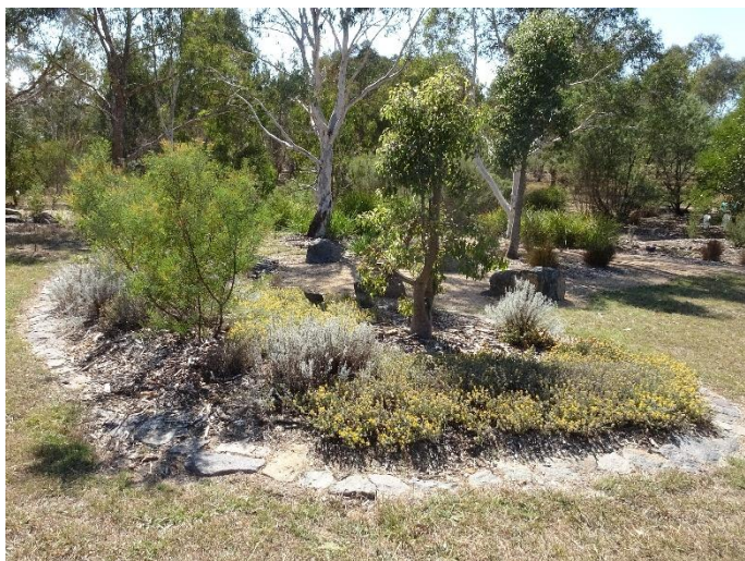
The Kurrajong Garden. A visually attractive space with daisy and other species featuring.