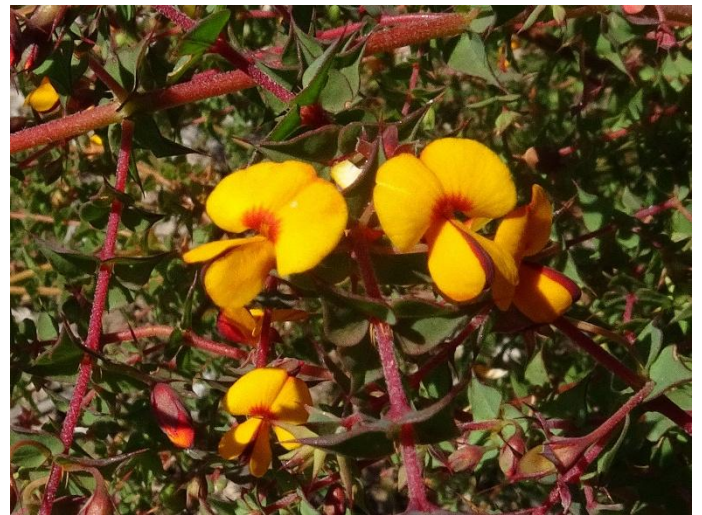
Pultenaea spinosa Spiny Bush-pea. Generally an erect pea that is notable for its whorled leaves.