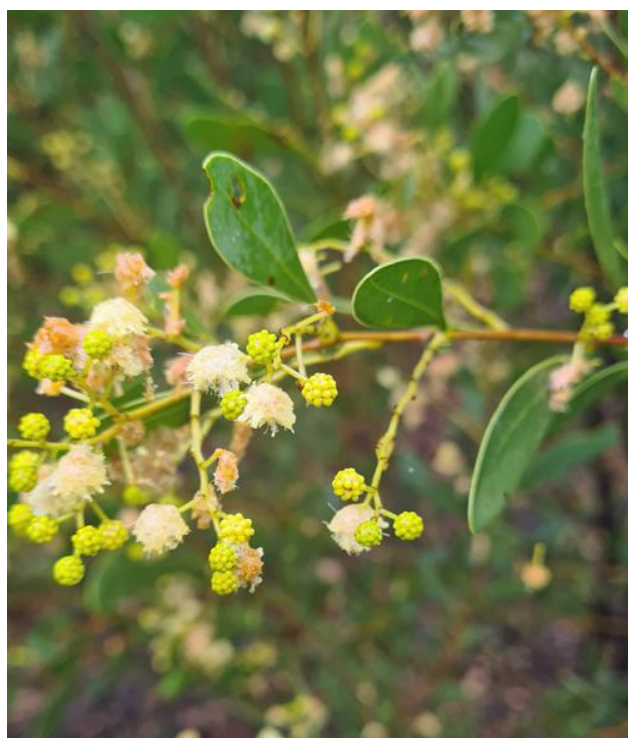
Acacia penninervis – Mountain hickory wattle Shrub 2-8m tall in flower late March in Wattle Walk