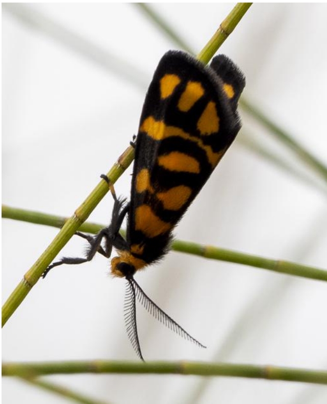
Lydia lichen moth – Asura lydia