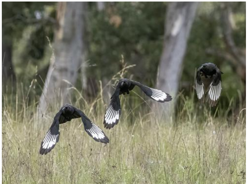
White winged choughs in flight