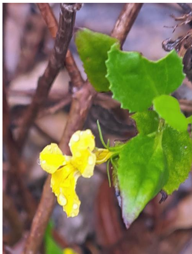
Goodenia ovata – Hop goodenia Small shrub to 2m in Central garden in flower in late March