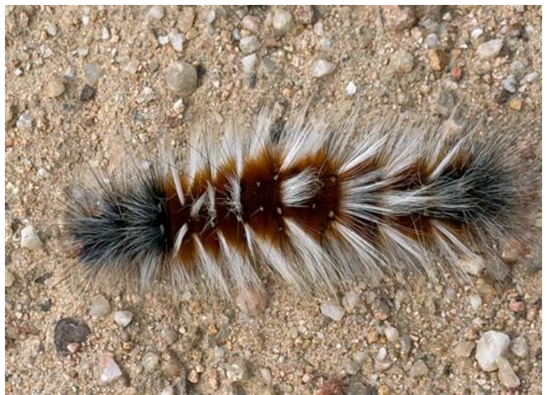
Hairy Mary caterpillar – Anthela varia moth caterpillar