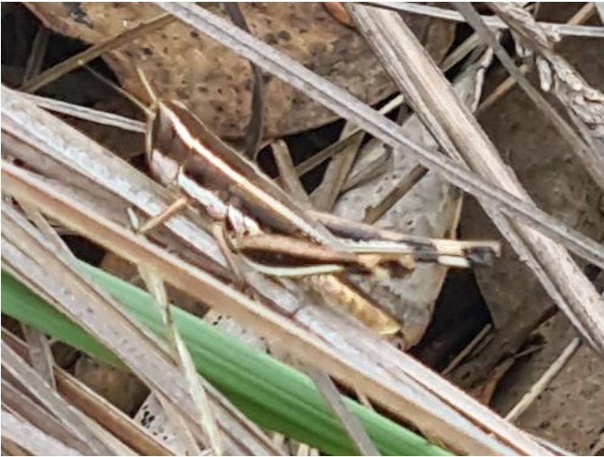
Well camouflaged in the wetland