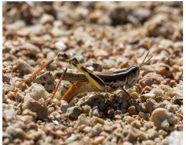
Macrotona grasshopper – Macrotona australis