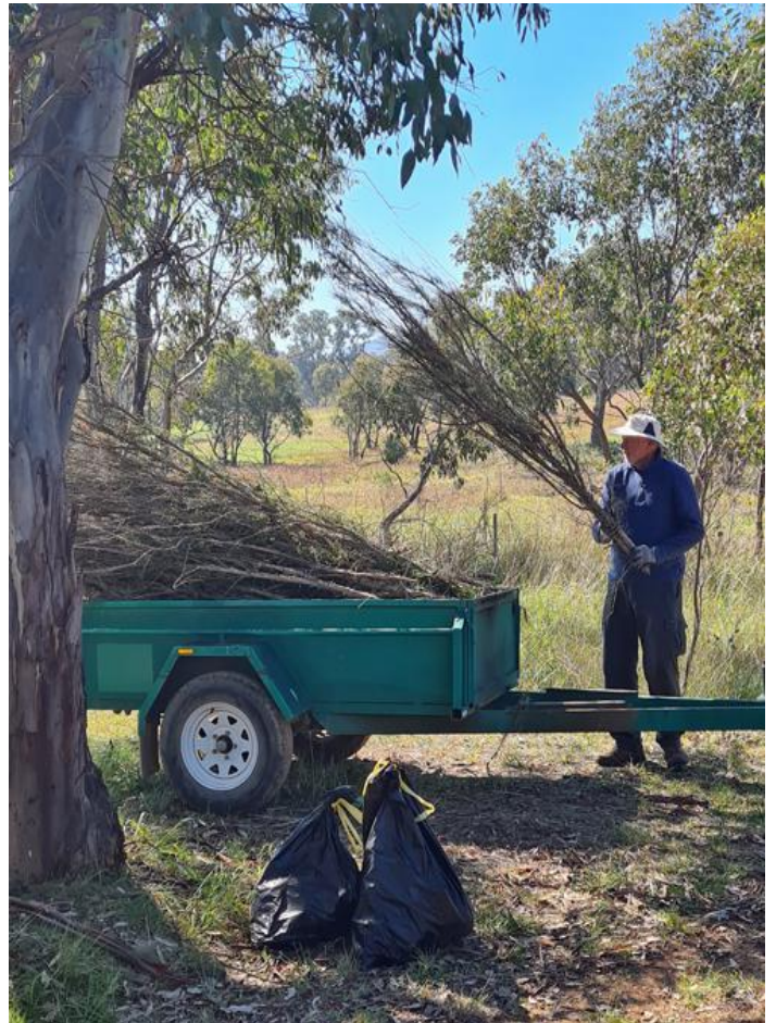
Digby loading prunings to be mulched