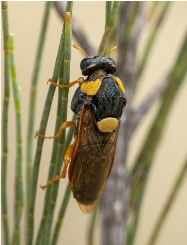
Sawfly -perga sp. On casuarina needles