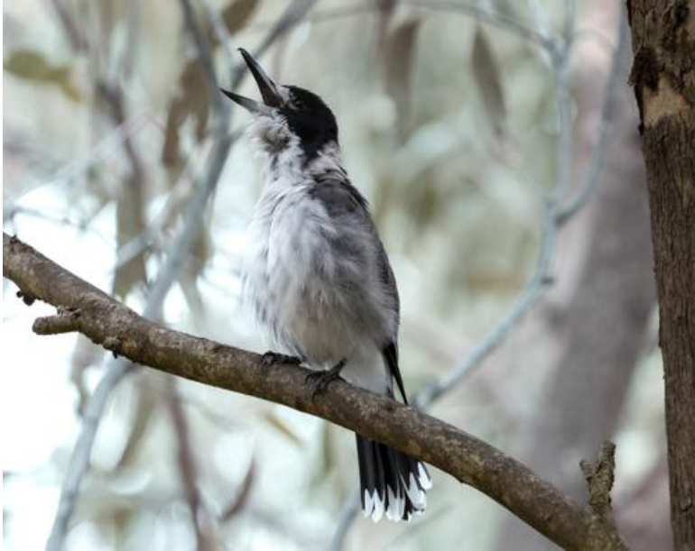
Grey butcher bird