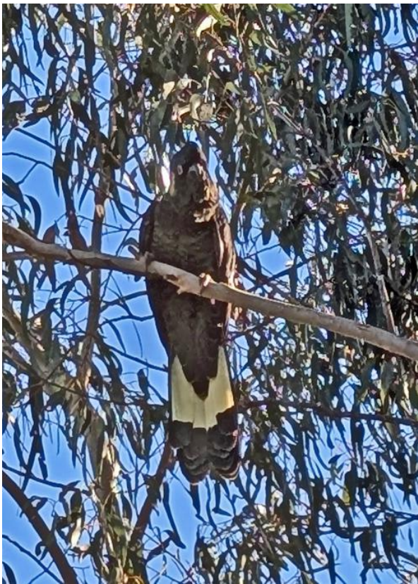
Yellow tailed black cockatoo