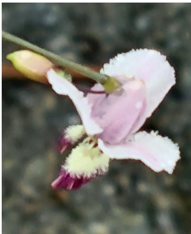
Arthropodium milleflorum – Vanilla lily 30cm tall, in flower in late March (Usually in November)