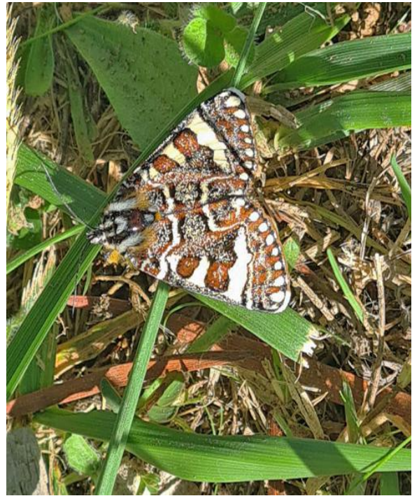
Pasture day moth – Apina callisto Looking for good spots to lay eggs