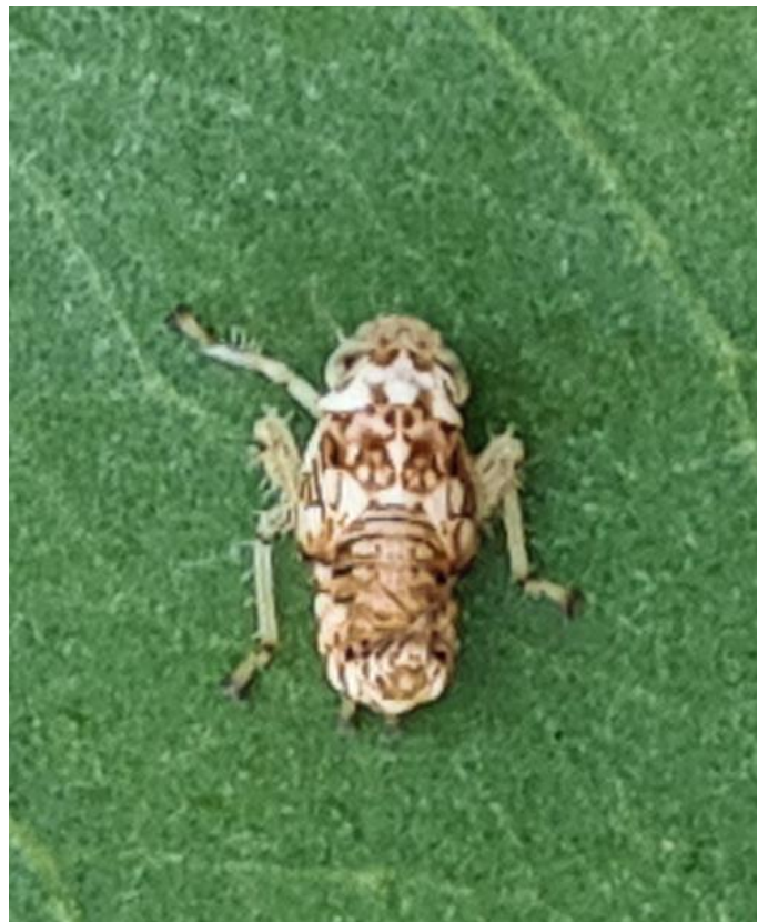
Green plant hopper nymph – Siphanta sp. On a eucalypt leaf