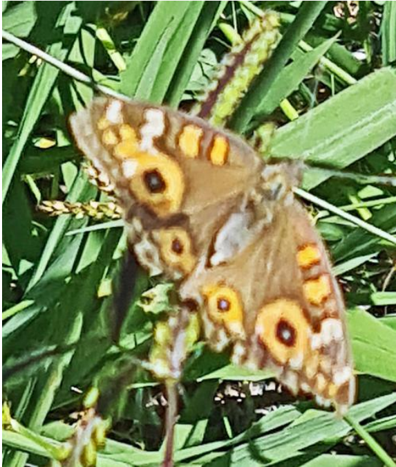
Meadow argus - Junonia villidis Enjoying some Autumn warmth