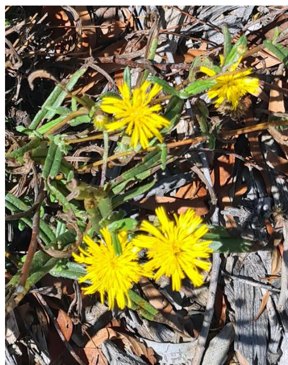
Podolepis jaceoides – Showy Copperwire daisy Perennial to 70cm at STEP entrance. Good pollinator