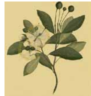
Capparis lucida Plate 6 from Banks' Florilegium

Friends are offered an exclusive opportunity to view the Banks' Florilegium in the Pictures Collection of the Library. Choose between two sessions: 1.30 pm or 2.45 pm. Each viewing will be one hour. Meet in the foyer of the Library 15 minutes ahead of the session starting time. Parking around the NLA is very tight, so allow plenty of time to find parking. Numbers are limited and bookings are essential by phone: 62558441 or email: bookings@friendsanbg.org.au indicating name/s, phone number and time preferred.