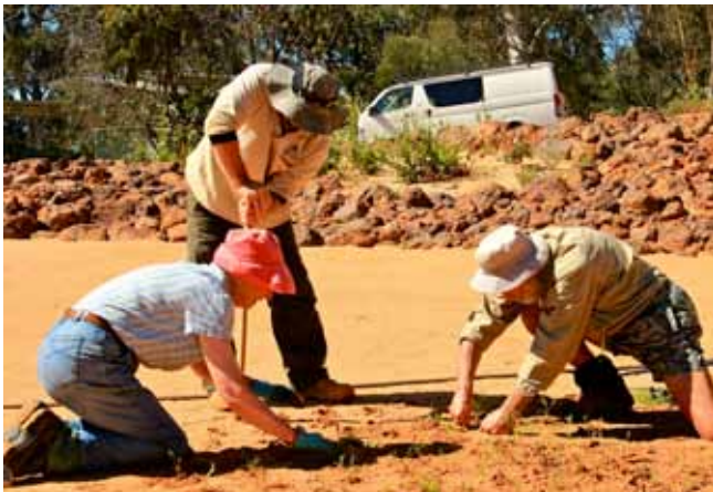
Guides helping staff with the final plantout of the Red Centre Garden in preparation for the official opening