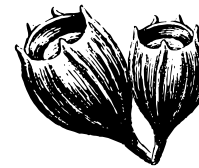
Angophora species have ribbed fruit

Most Corymbia species have thick-walled woody fruit that are more or less urn-shaped